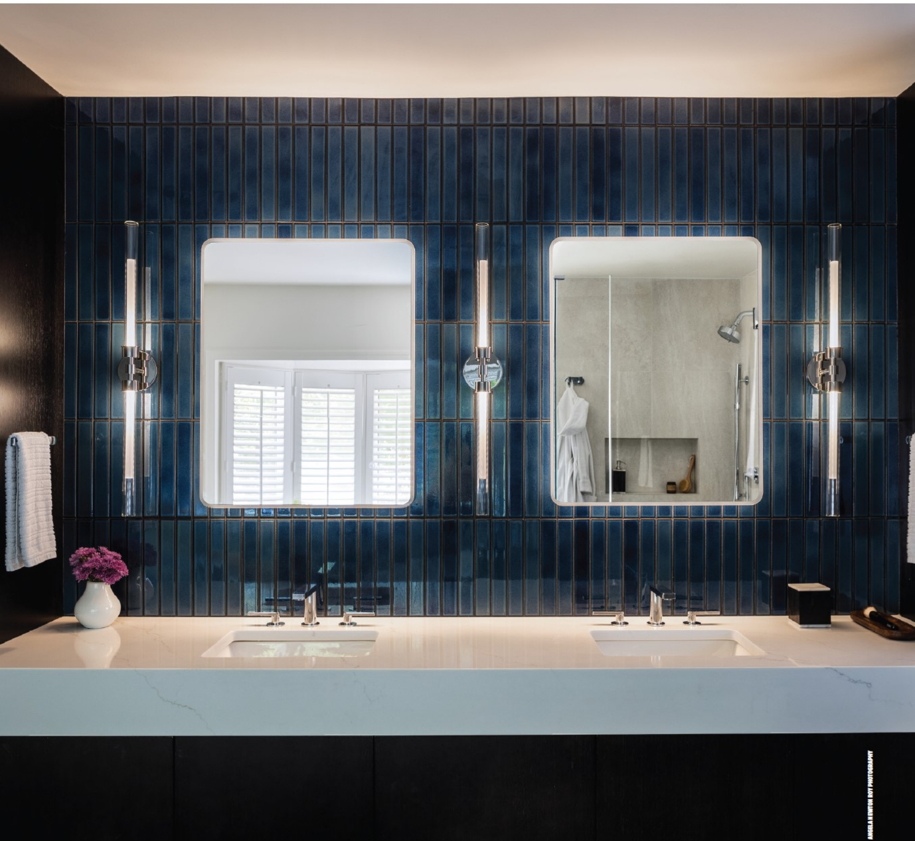
ANGELA NEWTON BOY PHOTOGRAPHY

If you have a space with a high ceiling, like a staircase to the second floor, then a hanging fixture may be the perfect way to make sure your light is